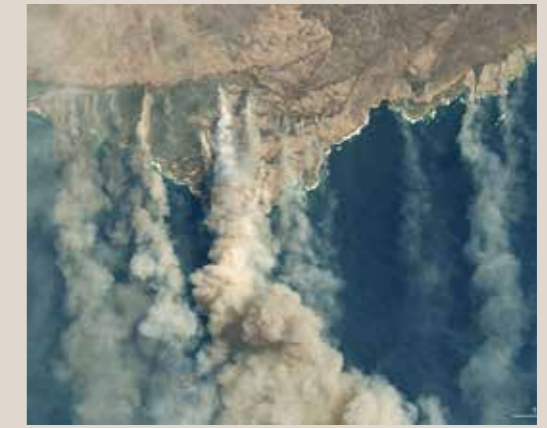
Figure 5: Smoke billows from the Kangaroo Island bushfire and out across the ocean.

By mid-January, smoke from the Australian bushfires had circumnavigated the globe 32 . New Zealand glaciers turned brown with ash that had blown in from the Australian bushfires, prompting Professor Andrew Mackintosh,