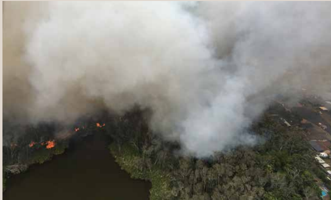
Aerial view of NSW mid north coast, Summer 2019.