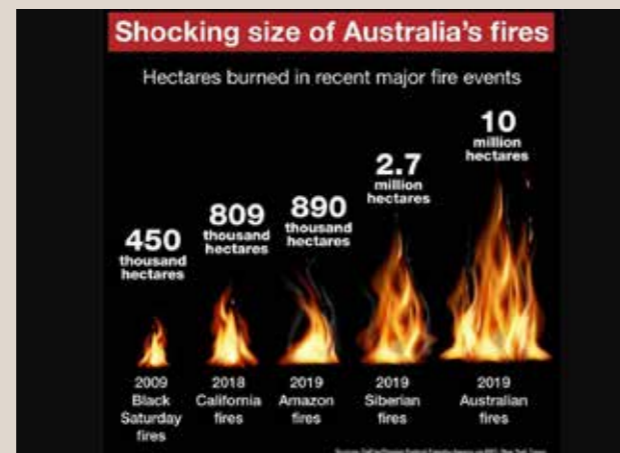
Figure 10: Bushfire scales compared

NASA satellite map on 22 January 2020, showing fires over previous seven days.