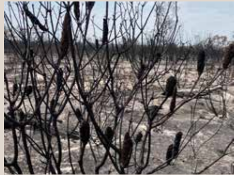
Figure 4: (top and bottom): Burrum Coast near Bundaberg, Queensland, November 2019.