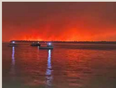
Bushfires burn to the coast during the 2019–2020 bushfire season.