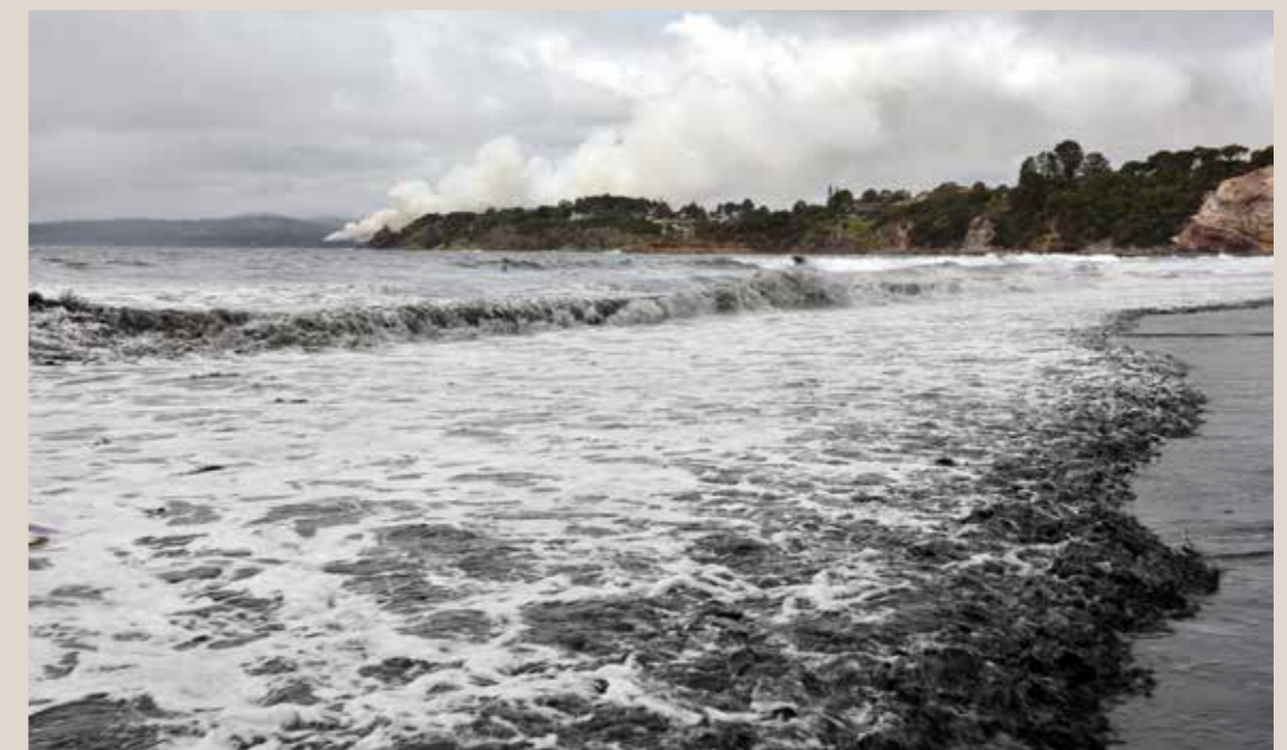
Figure 1: Sea water turned black by ash from wildfires laps onto a beach near Eden, NSW in January, 2020.