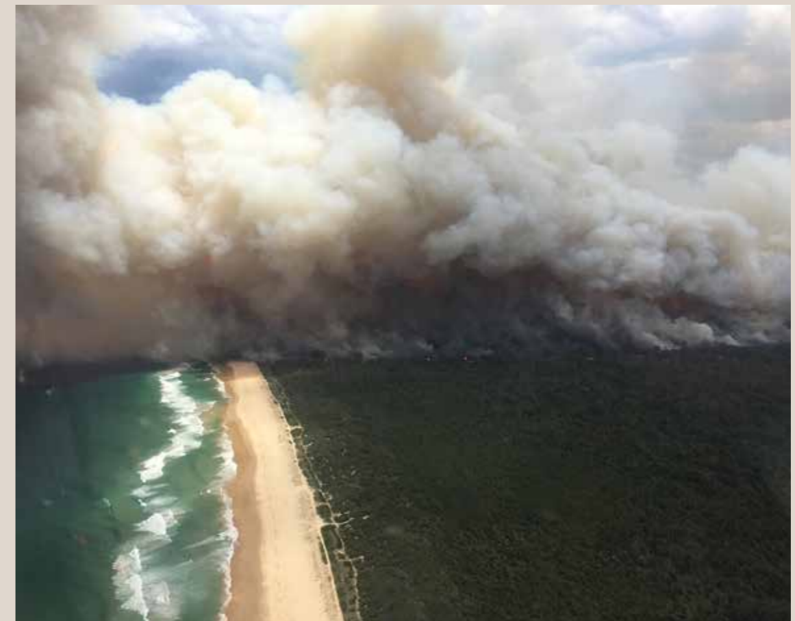
Figure 3: Aerial view of New South Wales mid north coast, Summer 2019.

Thousands of fires burnt across Australia during the 2019–2020 bushfire season, some down to the shores of estuaries and the ocean.