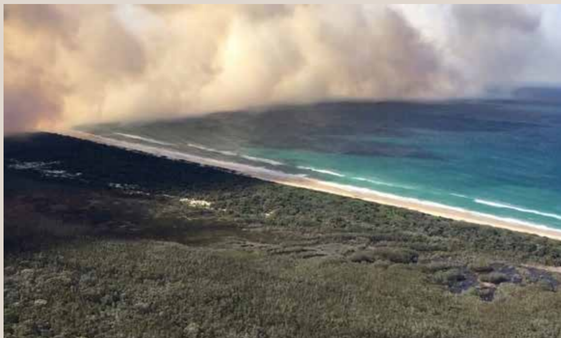
Aerial view of NSW mid north coast, Summer 2019.