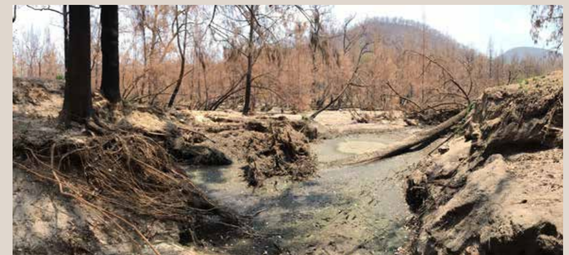
Figure 2: Burnt out waterway in northeastern New South Wales, January 2020.

The monitoring and analysis of the impacts of bushfires on marine and coastal environments needs urgent expansion and should be ongoing if adaptation is considered a primary strategy to manage increasing bushfire weather.