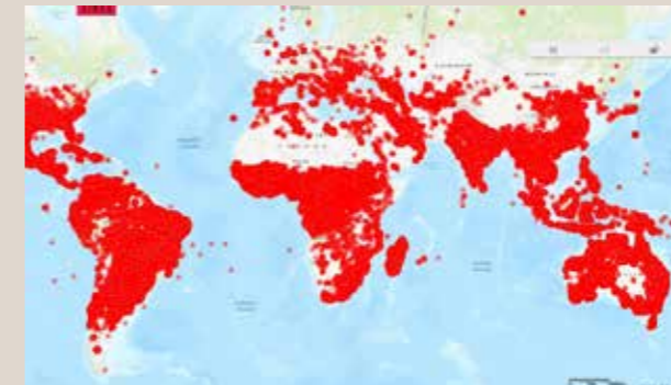
Figure 11: World map of fire hotspots: 1 December 2019 to 11 February 2020